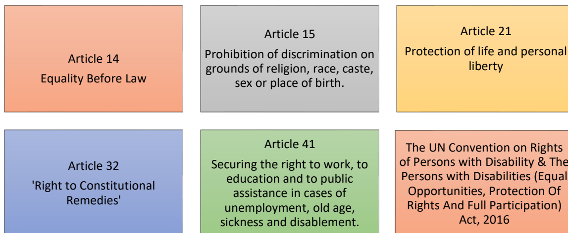
Figure 2.1 - Infographic of Legal Provisions in India for Rights of PwDs.

The section below discusses the various legal mandates at national and international level that guarantee financial access to PwDs. Given below is an info graphic listing the several legal provisions for rights of PwDs. (Figure 2.1)